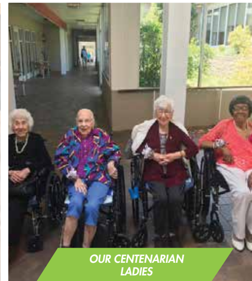
OUR CENTENARIAN LADIES