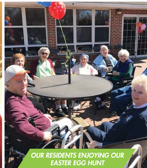
OUR RESIDENTS ENJOYING OUR EASTER EGG HUNT